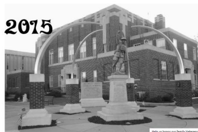
Craighead County, Arkansas

~~~~~ 2015 Calendars: The Calendars will be available at the November Meeting. They are $5.00 each. This year we are Honoring our Family Veterans.